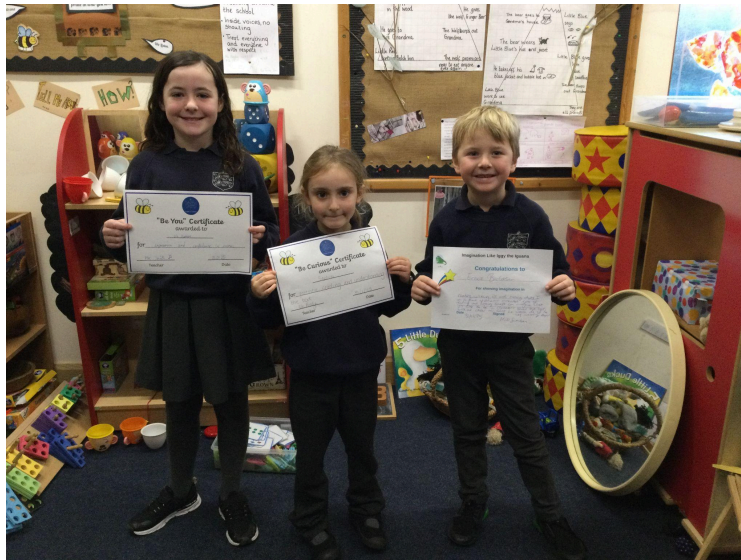
This week's certificate winners.