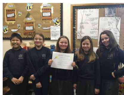
This week's certificate winners.