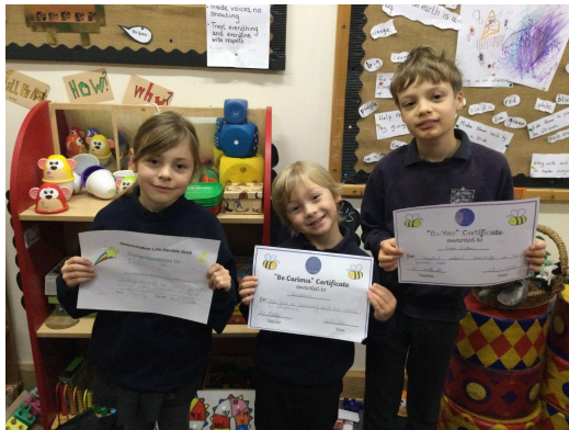
This weeks certificate winners.

Around the classrooms - A weekly round up of what we've been getting up to